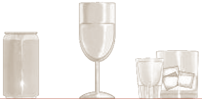
12 oz beer 5 oz wine 1.5 oz liquor

*NIAAA ( www.rethinkingdrinking.niaaa.nih.gov )